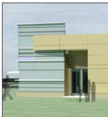
An artist's rendering shows the side of the new neonatal intensive care unit.