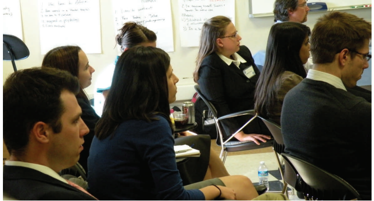
MD and MBS students listen to a CHR group present their findings.

Learn more about Research Day and CHRs from the luncheon program .