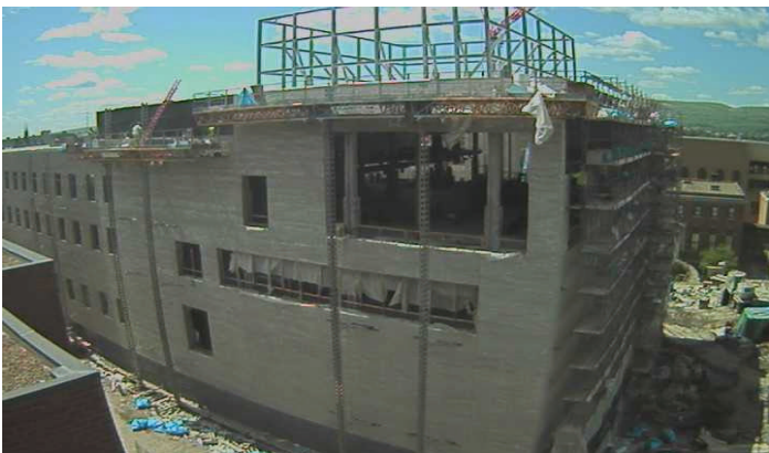
May 2010: Watch the building progress live via our online webcam .

One of the key elements of the new construction is that it's a green, or sustainable, building. By building a sustainable structure, TCMC is investing in the future of our environment with eco-friendly materials that will improve efficiency and cut operation costs. The exterior façade of the building is constructed of a granite stone veneer indigenous to Pennsylvania and is quarried within a 500-mile radius of the building site. The interior components also have recycled contents such as structural steel, sheet metals and metal studs while the cooling water is produced from recycled storm water which is collected from rain water leaders and storm lines and stored in underground cisterns.