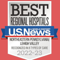
Badge shown is for Geisinger Medical Center and its subsidiaries.

Five Geisinger hospitals were recognized for high performance in the 2022 U.S. News & World Report "Best Hospitals" rankings. They received high performance rankings for a variety of specific procedures and conditions. Read on to find out where each hospital took top honors: