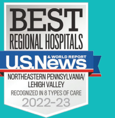
Badge shown is for Geisinger Medical Center and its subsidiaries.

Five Geisinger hospitals were recognized for high performance in the 2022 U.S. News & World Report “Best Hospitals” rankings. They received high performance rankings for a variety of specific procedures and conditions. Read on to find out where each hospital took top honors: