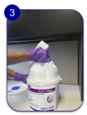
Tear or cut open the wipe package and place the bag back into the bucket.