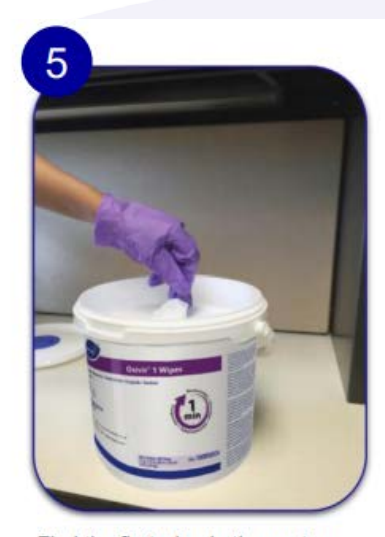
Find the first wipe in the center of the roll, and pull it up.