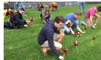
Students planted pinwheels on the TCMC lawn in honor of Child Abuse Awareness Month.