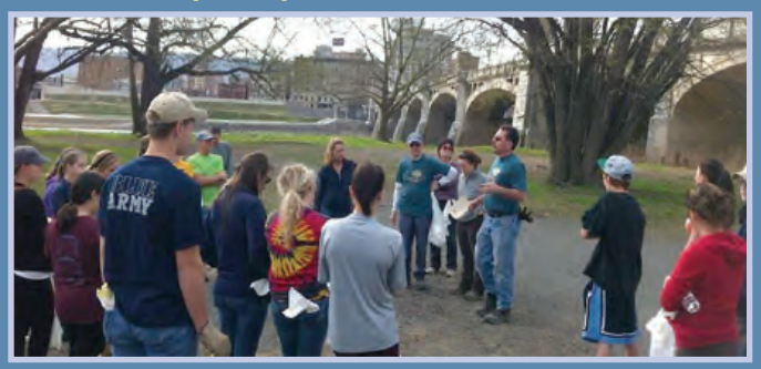
Volunteers from the north and south campuses start cleanup work near the Susquehanna River in Wilkes-Barre.

The MD Class of 2013 participated in community-wide service days in their regional campuses this spring. Students from the north, south and west campuses got hands on cleaning up the watershed areas of Wilkes-Barre's Riverfront Parks and completing yard work at the AIDS Resource Center in downtown Williamsport.