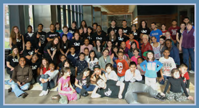
This spring, SEWAG volunteers hosted The University of Scranton's Urban Beats dance troupe to perform and teach program participants to dance.

This winter, TCMC students began the Science, Entertainment Writing and Arts Group (SEWAG) with a mission to work with youth who would not typically participate in extracurricular activates due to financial burdens and other social barriers.